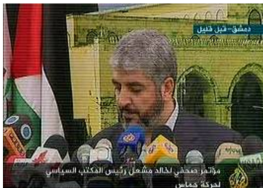
Khaled Mashal speaking about the abducted Israeli soldier, Gilad Shalit (Al-Jazeera TV, April 21).

■ [Bullet] Former American president Jimmy Carter's attempt to promote a cease fire between Israel and Hamas failed. He went on a flying trip between Jerusalem and Damascus, where he spoke with senior Hamas figures, including the delegation headed by Mahmoud al-Zahar, who had arrived from the Gaza Strip. In the talks held in Damascus Khaled Mashal rejected Carter's suggestion that Hamas announce a unilateral one-month cease fire. Khaled Mashal said that Hamas preferred to continue indirect negotiations, to which it is committed. No agreement was reached regarding Gilad Shalit, the abducted Israeli soldier, however Khaled Mashal expressed readiness to deliver a letter from him to Israel.