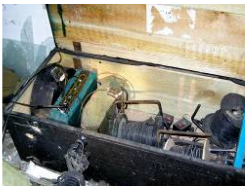
Weapons found during an IDF action inside a mosque on the outskirts of Sajaiya (IDF Spokesman, April 16).

■ On the morning of April 16 an IDF force near Kibbutz Beerli (about 4 km – 2 ½ miles – southwest of the Karni Crossing) observed two armed Palestinians placing IEDs near the security fence . The force attempted to prevent their action, and entering the Gaza Strip found themselves ambushed by a six-man terrorist operative squad. The terrorists, some of whom had been in hiding, shot at the IDF force, exploiting the fog cover. In the exchange of fire three IDF soldiers were killed and three wounded . The terrorists apparently managed to escape. Hamas claimed responsibility for the attack. 1