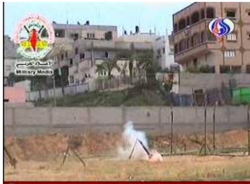
Palestinian Islamic Jihad rockets fired in close proximity to a residential neighborhood.

■ During the past week there was a sharp increase in the number of rockets and mortar shells fired at Israeli towns and villages in the western Negev and at Israeli security forces. A total of 71 rockets were fired, compared with nine the previous week. Most of the rockets targeted Sderot. On April 21 one of them landed near a car on Kibbutz Gevim, seriously wounding a four-year old child. The Palestinians also shot at agricultural workers gathering potatoes in the fields of Kibbutz Nir Oz.