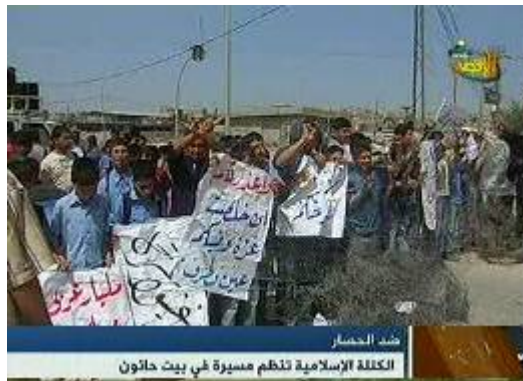
A procession in Beit Hanoun to protest the blockade (Al-Aqsa TV, April 21).