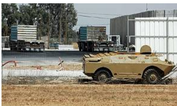
BRDM armored personnel carrier confiscated by Hamas from Abu Mazen's security forces, used during the attack at the Kerem Shalom Crossing (Photo courtesy of the IDF Spokesman, April 19).