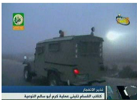
Jeep camouflaged as an IDF vehicle used by terrorist operatives during the attack at Kerem Shalom.