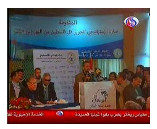
The meeting's closing statement (AI-Alam TV, January 25).

The closing statement of the meeting was severely critical of the PA ("the Oslo group") and that it "is not authorized to speak for the Palestinian people either in the territories or the dispersion [beyond Palestine]." The statement also condemned the policies of the PA and its security forces against the "resistance" (i.e., the terrorist organizations), and rejected any step intended to settle the refugees in the countries where they currently live (Agence France Presse, January 25).