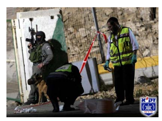
The scene of the attack at Shoafat (Photo courtesy of Zaka, January 24)