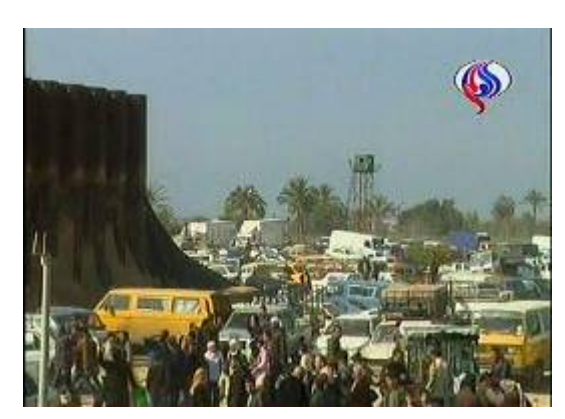
Crowds of people and vehicles streaming through the breached Rafah Crossing (AI-Aqsa TV, January 24).

The escalation of Hamas's attacks against Israel and the lack of fuel and basic commodities following the closure of the Gaza Strip crossings were exploited by Hamas to exert pressure on Egypt. The objective was to open the Rafah Crossing under Hamas control and to cancel the Crossings Agreement of August 2005. Hamas used the Gazan population to carry out protest demonstrations and breach the fence between Egypt and the Gaza Strip in a number of spots. Once the fence was down, hundreds of thousands of Gazans rushed into Egyptian Rafah in an uncontrolled stream which has continued for seven days.