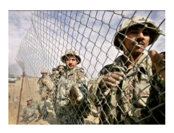
Egyptian security forces erecting a wire fence to reclose the breaches at Rafah (Muhammad Salem for Reuters, January 28).