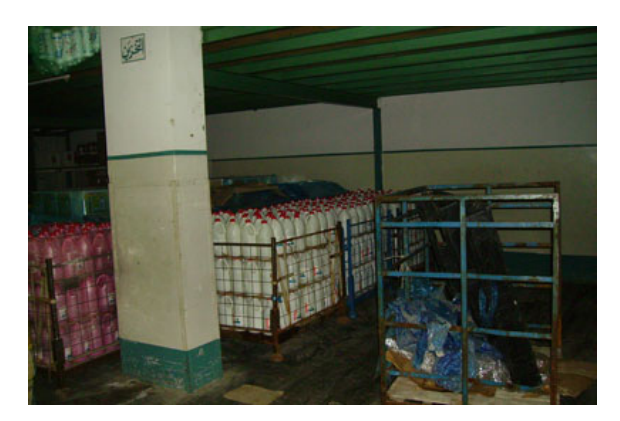
On January 22 materials were seized in two factories east of Nablus during routine IDF activities. The unauthorized materials can be used to manufacture explosives and rockets (IDF Spokesman's Website, January 22).