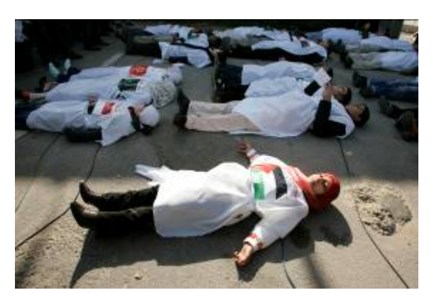
Palestinian children dressed in shrouds demonstrate for the opening of the crossings (Reuters, January 28).

At the same time, Hamas continues organizing protests against Israel's closure of the crossings. It organized a demonstration using children wearing shrouds who waved the flags of Arab and Islamic countries and appealed to them to "lift the blockade" (PalMedia Website, January 29).