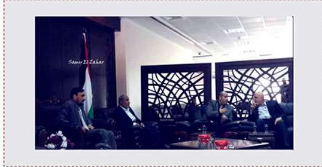
Senior Hamas figures wait in the VIP lounge at the Rafah crossing en route to a meeting in Cairo (Twitter account of Palinfo, March 12, 2016).