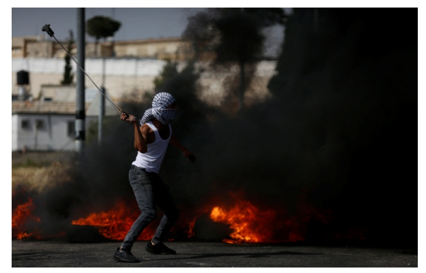
Fatah terrorist operatives riot at the northern entrance to al-Bireh (Wafa, May 21, 2021).