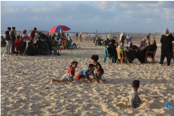
Gazans go to the beach (Wafa, May 22, 2021).