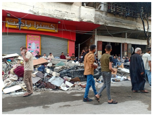
Gazans visit ruins and have their pictures taken (Wafa, May 21, 2021).