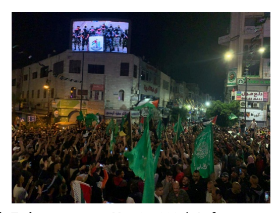
Right: Hamas "victory parade" in Ramallah (Palinfo Twitter account, May 21, 2021). Left: Palestinians riot at the Hawwara roadblock (south of Nablus) (Wafa, May 21, 2021).