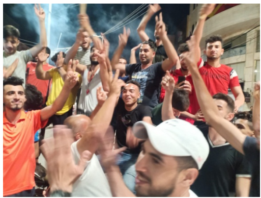
Gazans celebrate the end of the hostilities (Wafa, May 21, 2021)