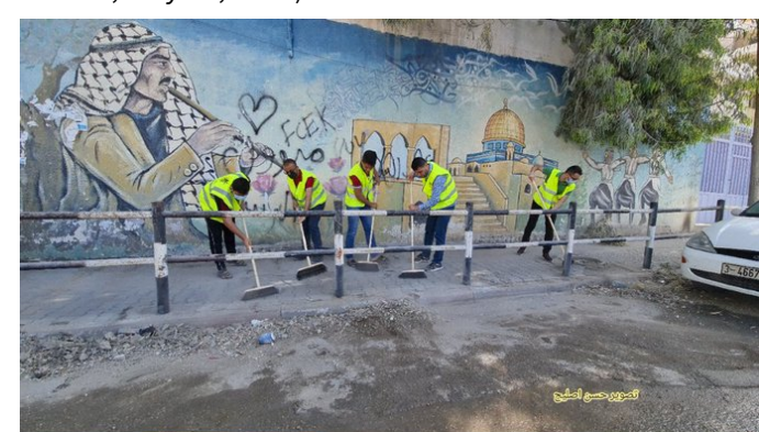
Gazan volunteers remove the rubble and clean the streets (Twitter account of journalist Hassan Aslih, May 23, 2021).