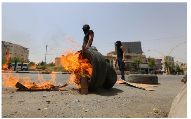
Palestinians riot in Hebron (May 21, 2021).