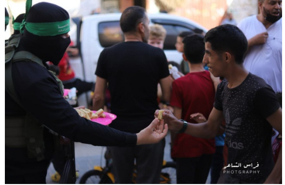
Right: Hamas terrorist operatives celebrate their "victory" by handing out cake and candy. Left: Gazans thank Hamas operatives for fighting Israel (Palinfo Twitter account, May 21, 2021).