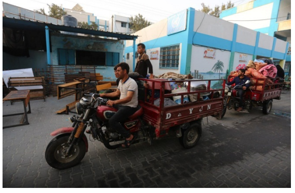
Gazans leave the UNRWA schools they stayed in during the fighting (Wafa, May 21, 2021).