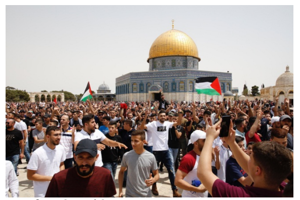
Palestinians on the Temple Mount after the Friday prayer (Twitter account of journalist Hassan Aslih, May 21, 2021).