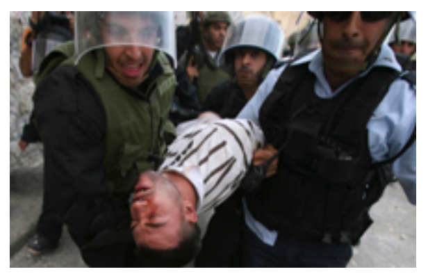
More on beating and abuse [2]