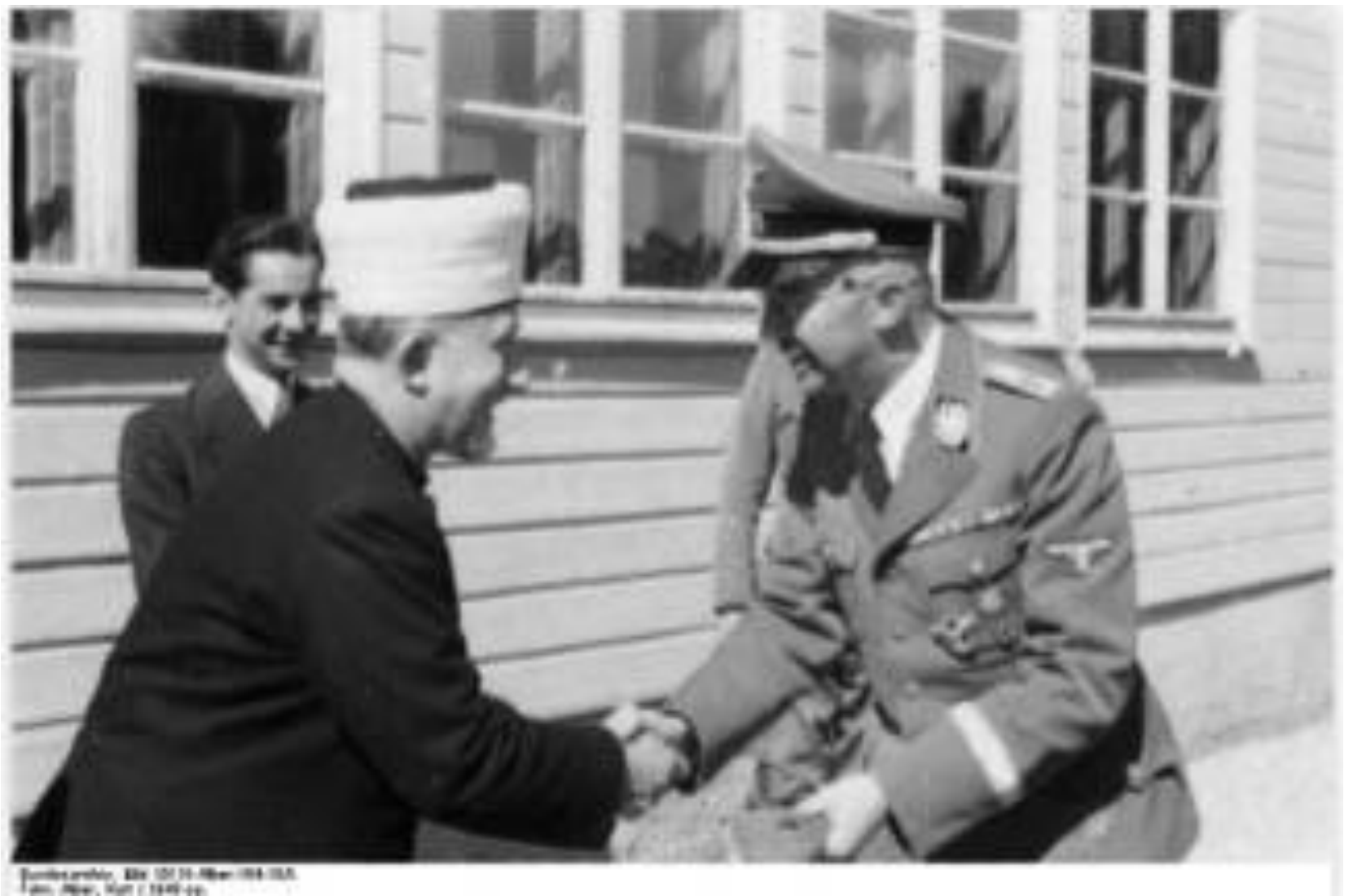
Amin al-Husseini (left), Heinrich Himmler, SS chief (right), 1943