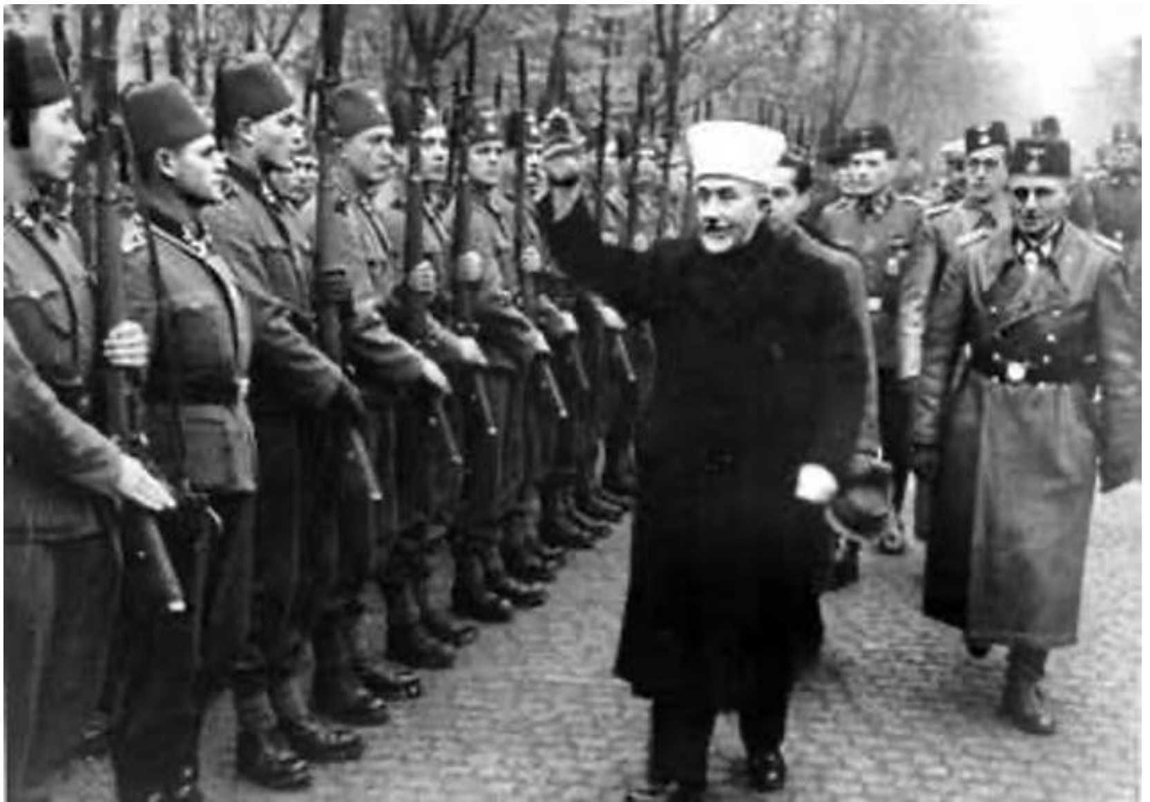
Amin al-Husseini greets Muslim Waffen-SS members with a Nazi salute, November 1943