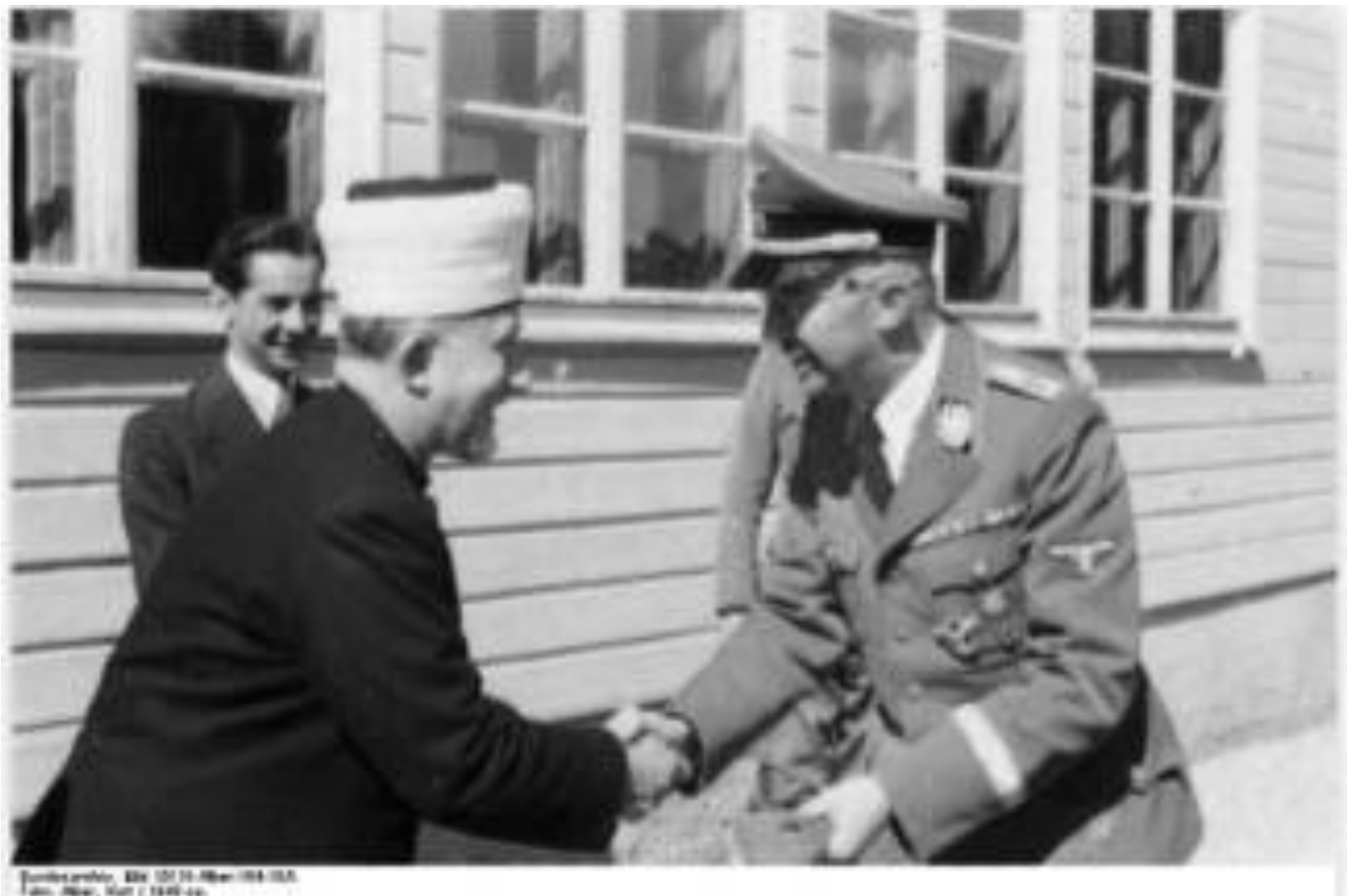
Amin al-Husseini (left), Heinrich Himmler, SS chief (right), 1943