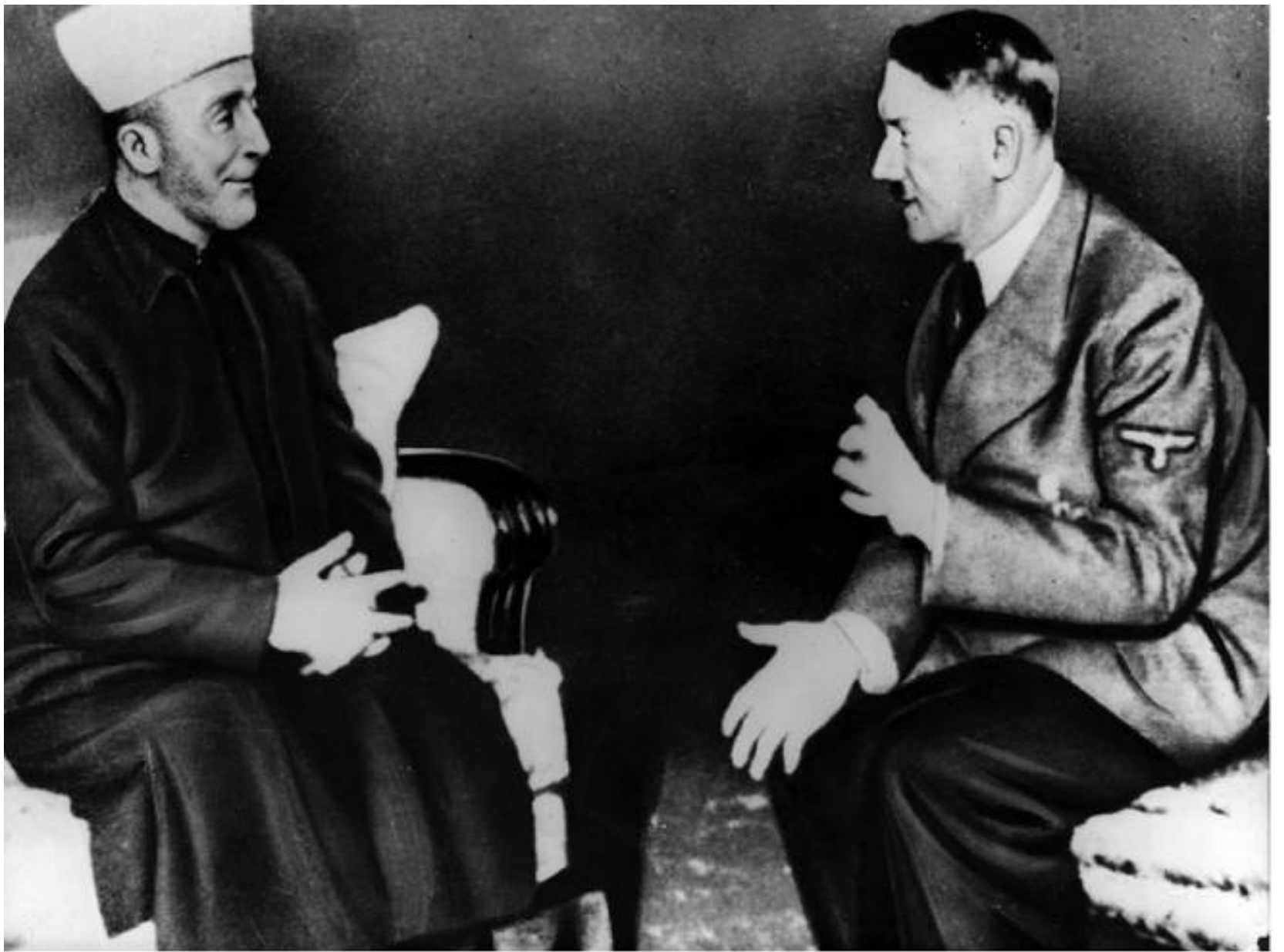
Amin al-Husseini (left), Adolf Hitler (right), Berlin, November 28, 1941