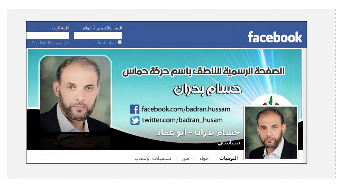
Official Facebook page of Hussam Badran (Abu Imad), Hamas spokesman (Facebook, June 25, 2014).