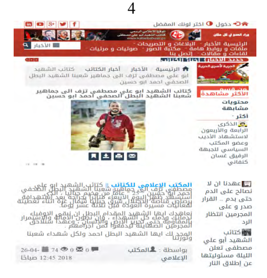
Death notice issued by the military wing of the PFLP (Abu Ali Mustafa Brigades website, April 26, 2018).