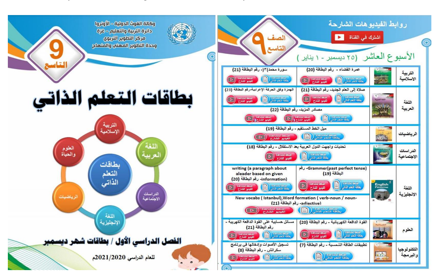
Cover page of UNRWA produced material for Grade 9 labeled for use in December 2020

Subsequent to its publication, UNRWA acknowledged it had produced and distributed inappropriate materials to Palestinian students. Several UNRWA donor nations expressed concern over the findings of the report including Germany, the United Kingdom and Norway; Canada and Australia launched probes into the matter. While acknowledging that it had distributed inappropriate materials to children, UNRWA officials attempted to minimize the issue by arguing that only a small percentage of the overall material was identified as being inappropriate. This contradicts UNRWA's zero-tolerance approach to hateful content. UNRWA also stated that the problem had been rectified and all instances of hate and incitement had been removed by November 2020, a full eight months after the proliferation of this content began. Following the IMPACT-se report, the organization immediately locked all access to the self-study material, blocking further external scrutiny.