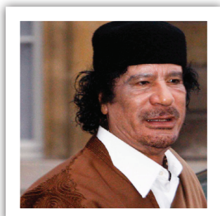
CHAIRPERSON – LIBYA Muammar Al-Gaddafi