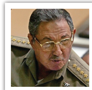
RAPPORTEUR – CUBA Raul Castro

Make no mistake, this conference will not combat racism, but will promote and fuel hatred toward Israel, America and the free world. This conference will not be about the spread of free expression , but how to curb it.